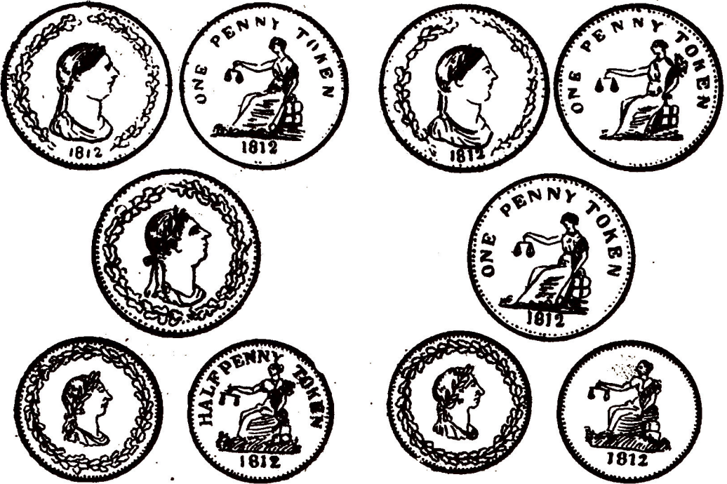
BRETON'S 957, 958, 959, 960 AND 961.

2. Large bust with point nearly touching oak wreath; laurel wreath with 3 top-leaves, left, one opposite acorn; WITHOUT letter H on truncation. Rev. The hair is so arranged around head that female appears to have a small cap, the top of which touches base of letter Y, to right; WITHOUT daisies in cornucopia. Small letters, close date. BRASS.